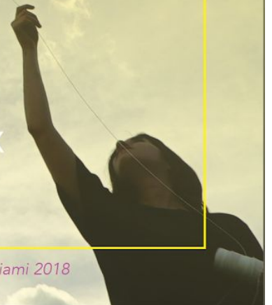
Performance is Alive at Satellite Art Show Miami 2018

SATELLITE ART SHOW AUSTIN, TX SXSW WEEK MARCH 13-17, 2019